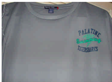
Dry Mesh Shirts- $20 Men's Crew Neck Women's V-Neck shirt

Please e-mail me you orders. gjnbln@comcast.net