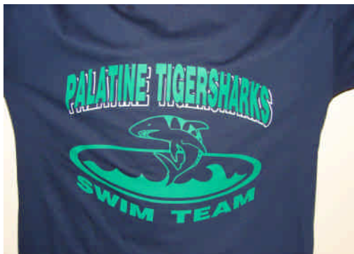
Long Sleeve T-shirt - $15