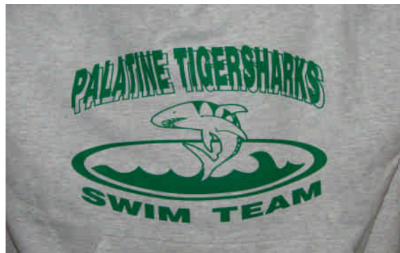
Hooded Sweatshirt - $20