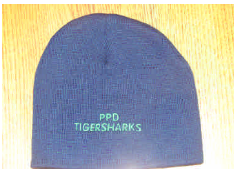
Navy Blue Knit Beanie Winter Cap - $10 PPD TIGERSHARKS in Kelly Green